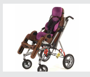
MPS on Push Chair Shown in Lilac/Chocolate.