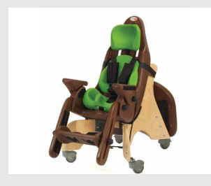
Mobile Floor Base Shown in Lime/Chocolate.