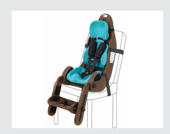
MPS Seat only Shown in Aqua/Chocolate.