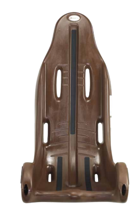
Large Shell (ML)