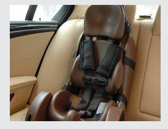
MPS Car Seat (see pg. 10) Shown in Chocolate/Chocolate.