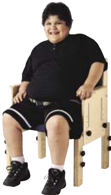
SCHOOL CHAIR X-WIDE

The TherAdapt® School Chairs come standard with a 1" pelvic positioning belt, and feature a height and depth adjustable slip-resistant, padded seat. The chair can be ordered with either a flat seat or a 10° anterior angle seat to promote therapeutic positioning and aid in independent transfers. All of the Wide and X-Wide School Chairs are reinforced with a steel support bracket under the seat.