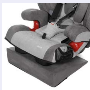
Seat wedge inside, and seat wedge below with additional + 10° seat tilt