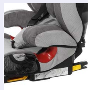
Model Seatfix with integrated Isofix arms for optimum protection in case of accidents