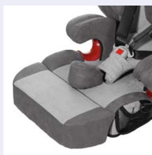
Abduction block and seat depth extension