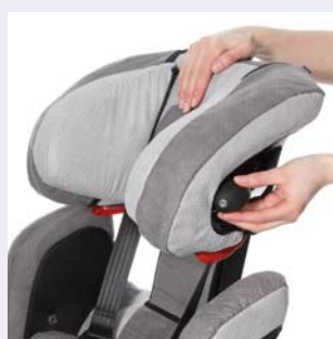
Optimum neck support by inflatable air cushion integrated in the headrest