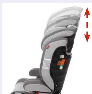
11-fold height adjustable headrest