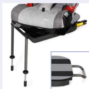
Turning plate with Seatfix connection and stand (detail: stabilising bow)