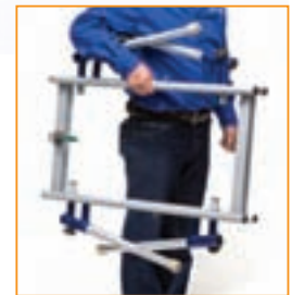
Foldable Tub Bench