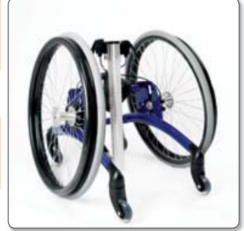
Frame colors Available in different colors for size1, 2+3, 4.

As standard the Rabbit is delivered with frame and centre bar. Please order accessories from the following pages.