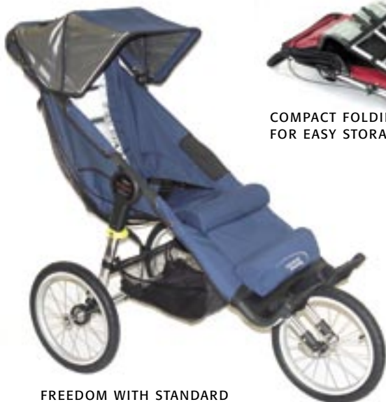
FREEDOM WITH STANDARD 16" WHEEL AND OPTIONAL ROLL PILLOW

Optional accessories include a mesh Bug Canopy , a clear vinyl Rain Canopy , a Carry Bag for easy transport, and a Roll Pillow for lower leg positioning.