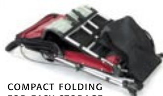
COMPACT FOLDING FOR EASY STORAGE