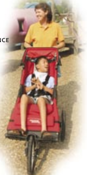
INDEPENDENCE PUSH CHAIR