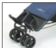
FRONT SWIVEL WHEELS WITH FOOTWELL KIT FOR FREEDOM