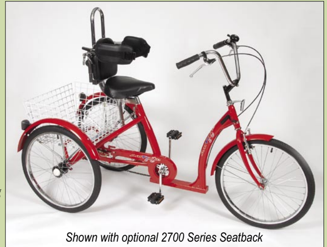
Shown with optional 2700 Series Seatback

Adaptations: 1/2" Expanding Pedals, Bench Seat, Foot Cups, Wrist Wraps, Pedal Blocks, 2700 Padded Seat Back, Exercise Pedals, Wrist Brace Holding Mitt.