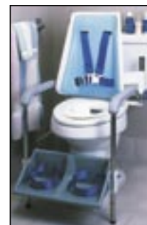
TOILET SUPPORT – HIGH BACK WITH OPTION A.

Each toilet support comes complete with a mounting base that attaches quickly and easily onto the toilet using the same bolts that hold the toilet seat to the bowl. It measures 18 1/2"W x 10"H. A choice of backs, for individual customization, lift off the base, freeing the toilet for regular use. Each back comes complete with a silicone and latex free, seamless, waterproof, padded back pad, and an anterior chest strap or straps for security. As your child grows simply replace the back with a larger size as the backs may be purchased separately. Note: The small-low back support, the small-high back support, and the medium-high back support all come with a seat reducer ring as well.