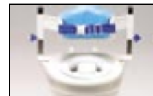
TOILET SUPPORT – LOW BACK WITH OPTION B.