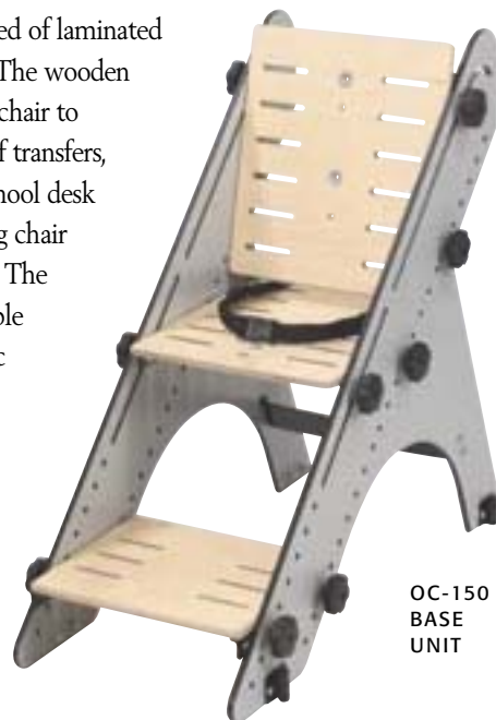
OC-150 BASE UNIT

The sides of the chair are constructed of laminated phenolic to withstand years of use. The wooden seat is height adjustable within the chair to allow it to be positioned low for self transfers, at a mid-range height to use at a school desk or play table, or up high as a feeding chair at the kitchen or dining room table. The seat is also depth and angle adjustable for individualized therapeutic pelvic and lower extremity positioning. The height and depth adjustable back can also be angled 30° back in space.