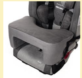
Table (rehab accessory)