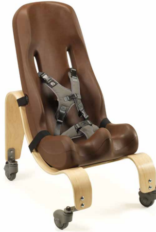
Sitter with Mobile Base