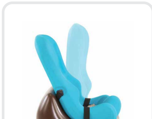
Sleek modern design provides up to 25° of tilt