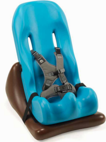
Floor Sitter Kit for Sizes 1,2,3