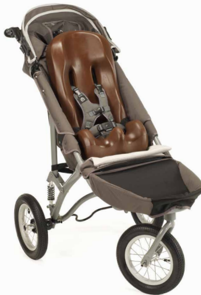
Jogger for Sizes 1,2 (page 22)