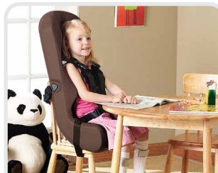
Attachment straps for securing to a standard chair