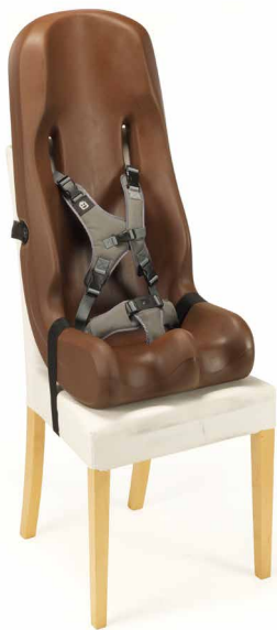
Attach to a chair

Sitters can be used in a variety of ways