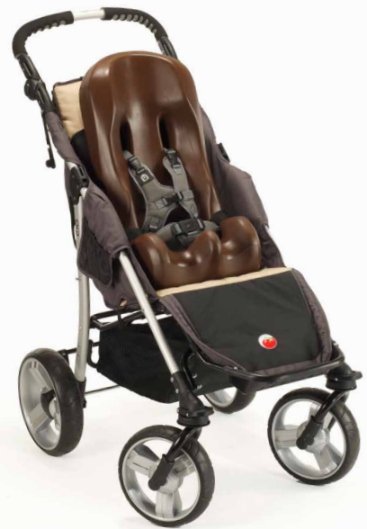
EIO Push Chair for Sizes 1,2 (page 20)