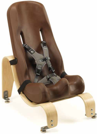
Sitter with Stationary Base