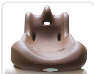
Contoured head and lateral support, shown as top view