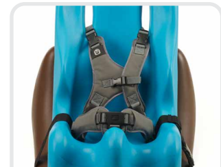
Adjustable 5-point harness