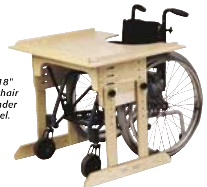
A standard 18" wide wheelchair fits easily under the Tray Easel.