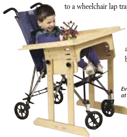
Evan is able to sit and play at the TE-200 with LS-24.

The Tray Easel has a rounded cutout across the front edge, similar to a wheelchair lap tray, for increased contact, improved upper extremity positioning, and support for the user. It comes complete with a Leg Set of choice that allows it to be adjusted to the height and angle required by the user.