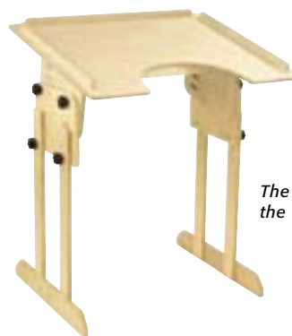
The Large Tray Easel (TE-200) with the 6" Leg Set (LS-6) and LS-18.