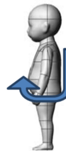
C-7 to navel over the diaper